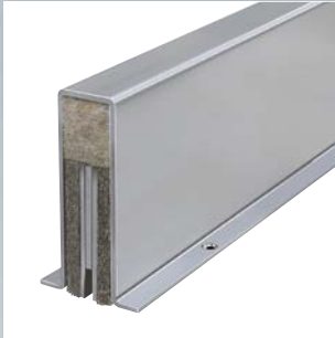
Profile Planet BL